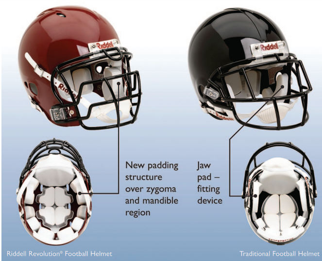
FIGURE 1. Design features of the Revolution helmet.

and requested that a study be conducted examining whether the Revolution helmet was effective for reducing the incidence and severity of concussion in high school athletes. During the last three football seasons (2002-2004), the UPMC Sports Concussion Program has directed a concussion management program for 17 high schools in Western Pennsylvania. A large-scale observational naturalistic cohort study has been conducted over the course of three football seasons with these schools. Approximately half of the participating athletes were fitted with the Revolution Helmet and the other half wore standard helmet types. However, helmet assignment was not controlled or influenced, in any way, by the researchers. There were two main research questions. First, the incidence rate of diagnosed concussion was closely followed between these two groups, with the intent of measuring concussion rates in athletes using both helmet types. Second, recovery times were detailed using a clinical protocol and IMPACT, a computerized neurocognitive test battery developed by the UPMC Sports Concussion Program. Prior research has shown utility of this program in delineating outcome following sports related concussion (6,8,19,21,26,27). All participating schools in this study were utilizing this software program as a tool for the clinical management of sports concussion.